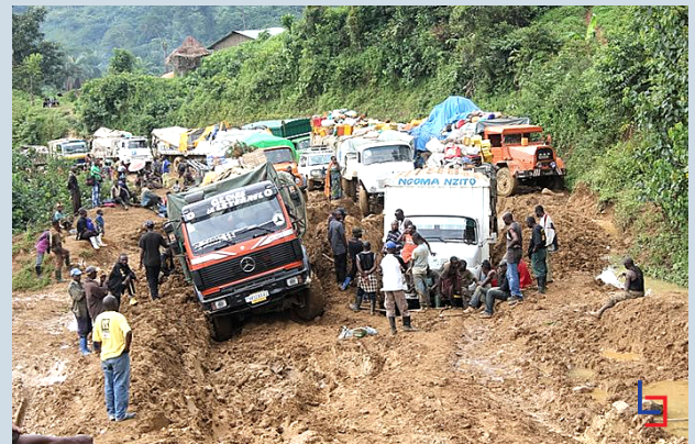
Above: A road on a Logenix route in the Democratic Republic of the Congo, Central Africa